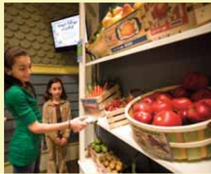
Greenwich Market exhibit, where children learn about eating healthy.